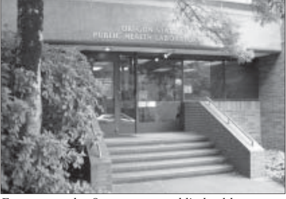
responsibility between the Entrance to the Oregon state public health OSPHL and the DEQ lab is laboratory in Portland, OR.

The OSPHL occupies part of a 1970's-era university building on the Portland State University campus. Under the same roof are the Oregon Department of Environmental Quality (DEQ) laboratory and the university's biology and chemistry departments. The division of responsibility between the OSPHL and the DEO lab is